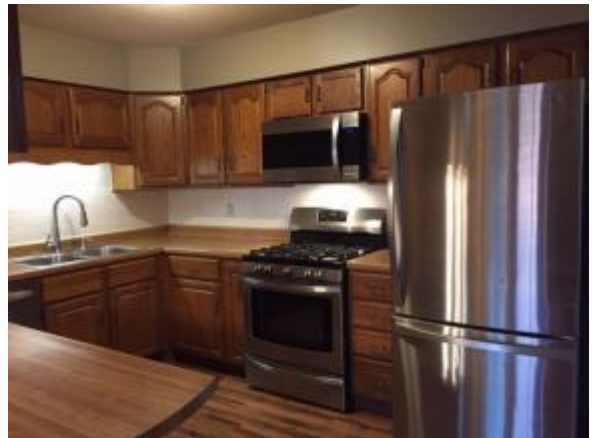
Copyright 2018 Decatur & Central,IL MLS. 10/22/2018 11:15 AM