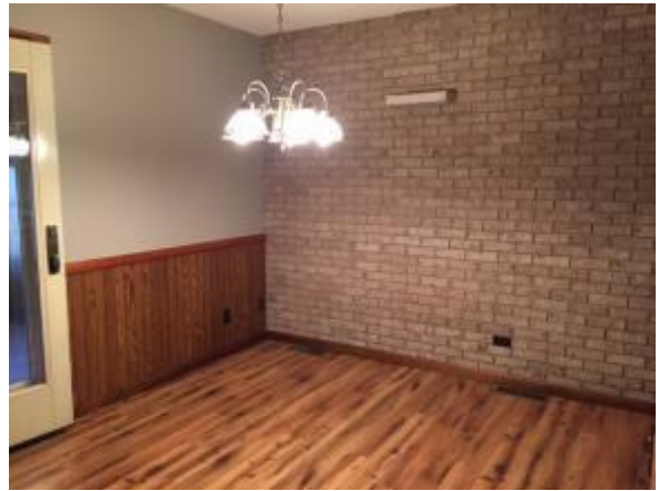
Copyright 2018 Decatur & Central,IL MLS. 10/22/2018 11:15 AM