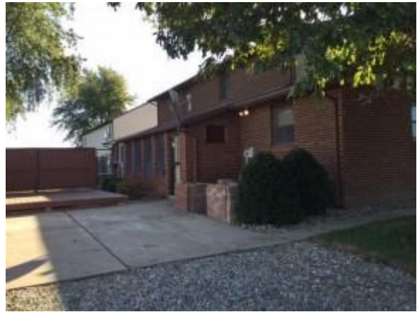
Copyright 2018 Decatur & Central,IL MLS. 10/22/2018 11:15 AM