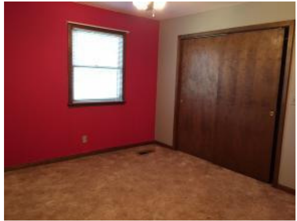
Copyright 2018 Decatur & Central,IL MLS. 10/22/2018 11:15 AM