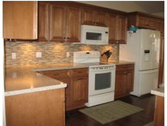
Copyright 2017 Decatur & Central,IL MLS. 09/21/2017 10:17 AM