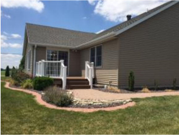
09/21/2017 10:17 AM