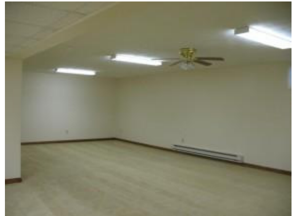
LOWER LEVEL FAMILY GATHERING AREA

Copyright 2017 Decatur & Central, IL MLS. 11/27/2017 09:02 AM