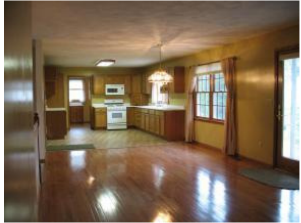
11/27/2017 09:02 AM