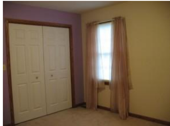
Copyright 2017 Decatur & Central,IL MLS. 11/27/2017 09:02 AM