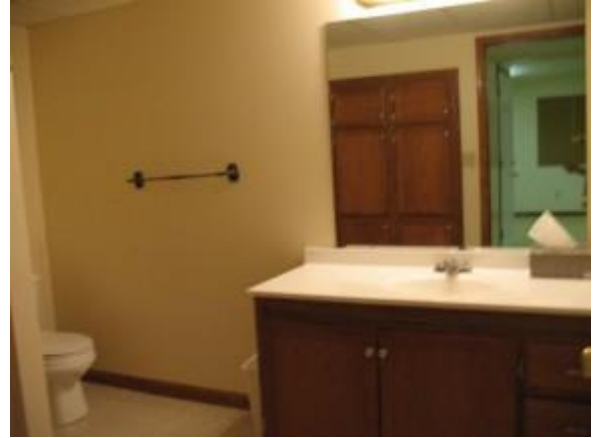
LOWER LEVEL BATH WITH SHOWER