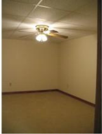
LOWER LEVEL GUEST BEDROOM