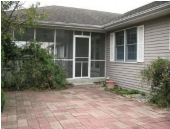
26'6 X 14' PATIO

Copyright 2017 Decatur & Central,IL MLS. 11/27/2017 09:02 AM