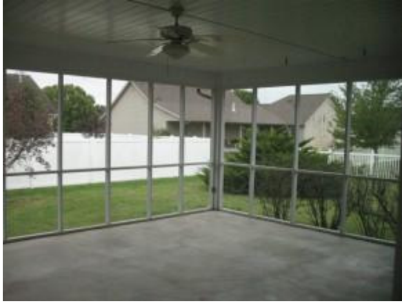
22 X 18' SCREENED IN PATIO