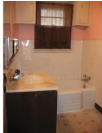
01/03/2018 12:14 PM