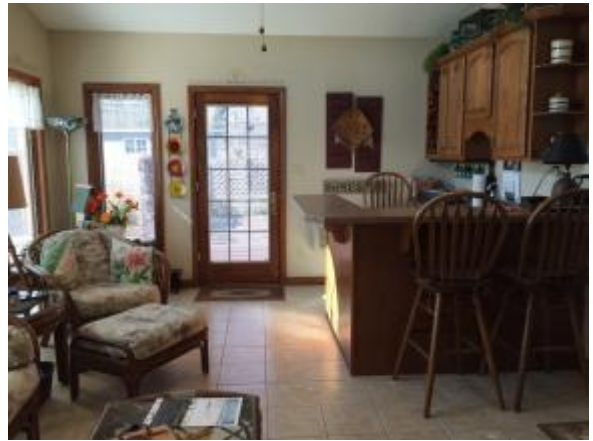
03/14/2018 11:41 AM