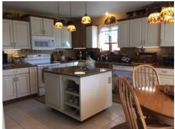
Copyright 2018 Decatur & Central, IL MLS. 03/14/2018 11:41 AM