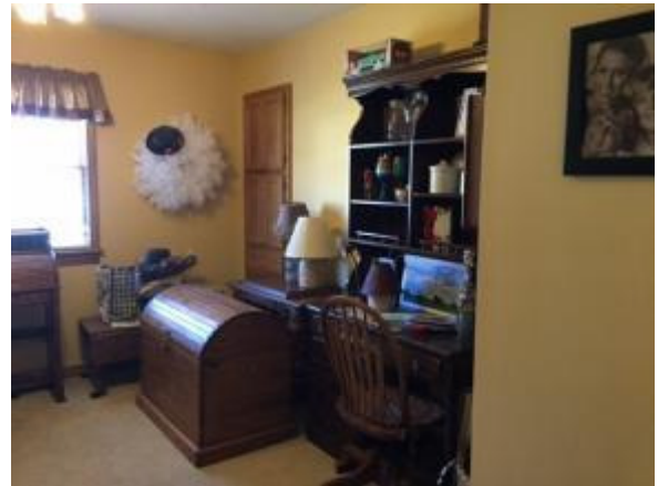
Copyright 2018 Decatur & Central,IL MLS. 03/14/2018 11:41 AM