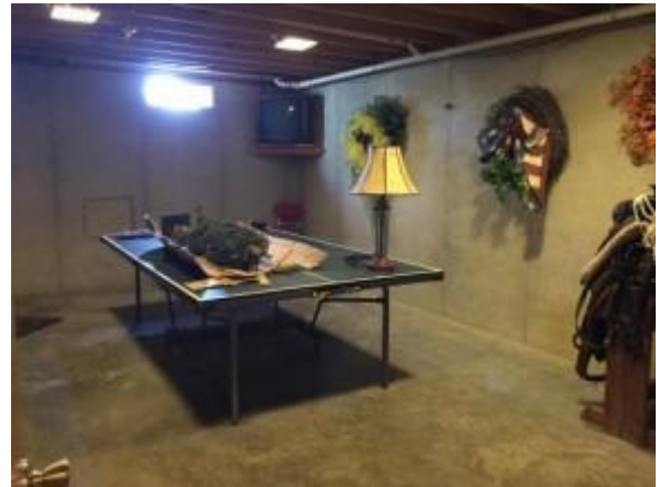
Copyright 2018 Decatur & Central,IL MLS. 03/14/2018 11:41 AM