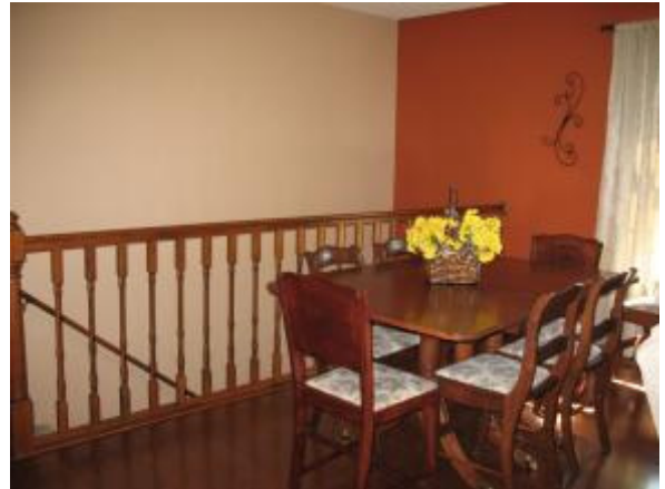
05/15/2017 03:18 PM