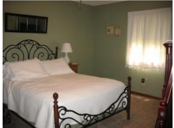
05/15/2017 03:18 PM